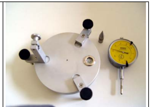
SWT 2 shaft wobble + centricity tester # 30-31210