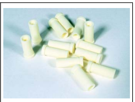
5 or 10 micron PP Sinter Filter # 31-63211-50 (10 µm) # 31-63511-50 (5 µm)

PHARMA TEST GmbH Siemensstrasse 5 D-63512 Hainburg (GER)